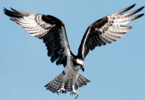
The Osprey is the official OTA mascot

"OTA is a special school because of the personal attention given to each student. No student at OTA is a seat or a number. My daughter feels SHE matters at OTA. She knows and engages with all staff and administrative personnel." -OTA Parent.