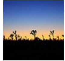
Joshua Tree National Park

“At OTA, we believe that we are responsible for ensuring that our students do not ever lose the wonder that is the core foundation of learning.”