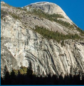
Yosemite National Park